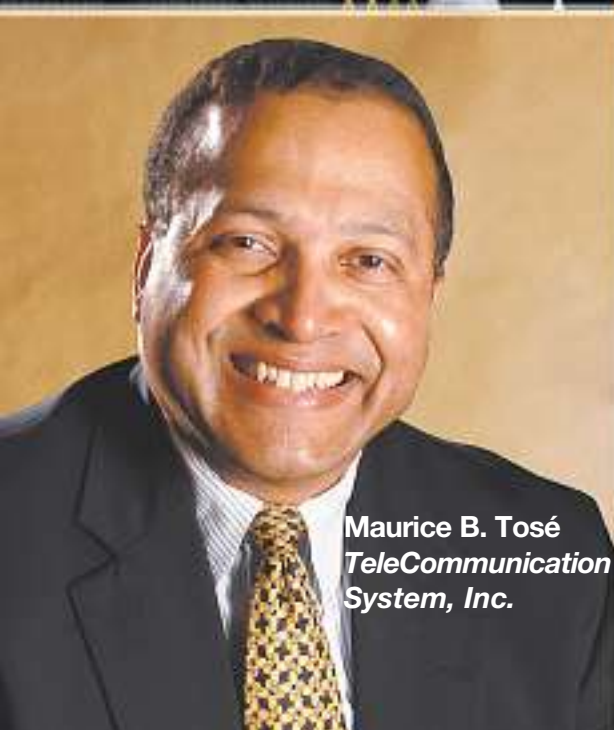
Maurice B. Tosé TeleCommunication System, Inc.